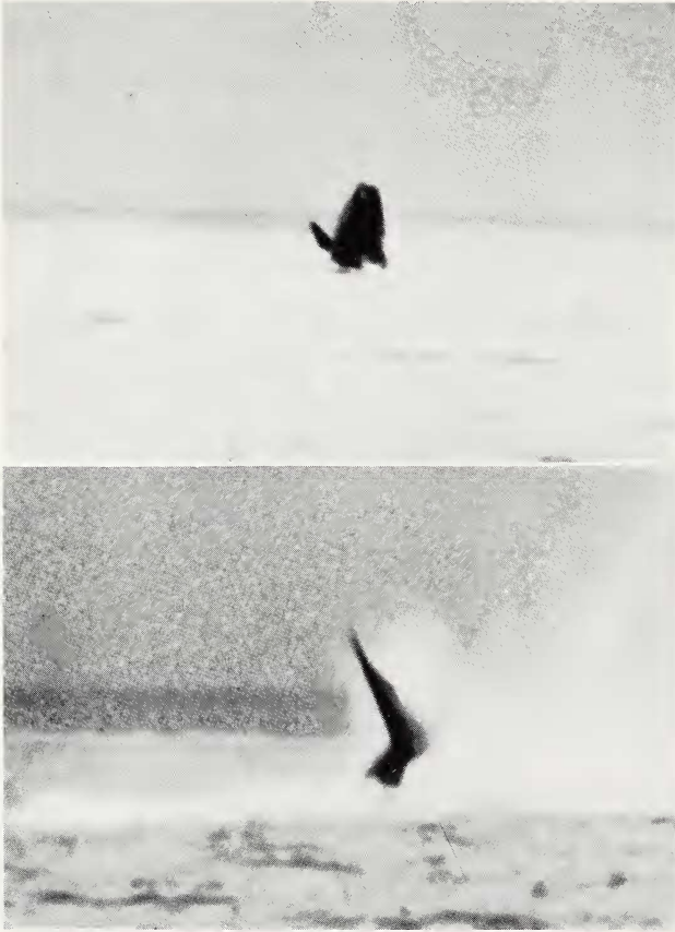
Fig. 2 (above) and 3 (below). A whale at the height of its leap, flippers outstretched, inverts to fall on its back. The head plunges beneath and the flukes then appear above the surface. (Photo from ciné-sequence)

Breaching: A whale, identified by a notch on one fluke (see Fig. 11), breached seven times in succession. The first leap occurred before the camera was operational, but was similar to the second. On the second breach, the whale left the surface at an angle of 80^\circ to the horizontal, showing both flippers (Fig. 2). It inverted to fall on its